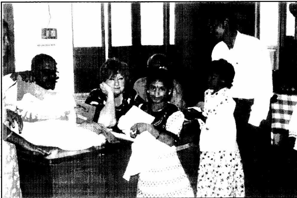
BENEFACTOR WITH BENEFICIARIES - PARRAINAGE PROGRAMME