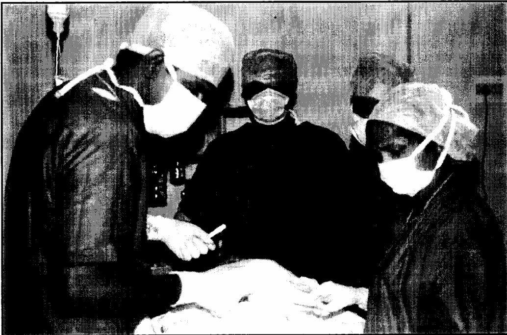
ONE OF THE 69 SURGERIES DONE IN 2001