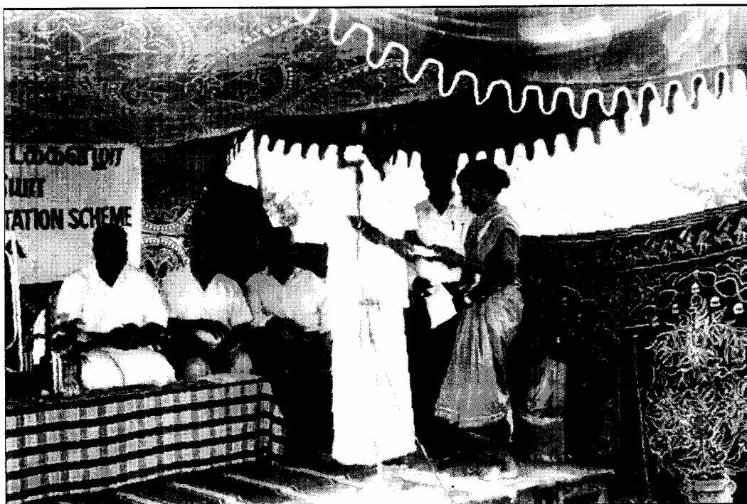
DISTRIBUTION OF LOAN BY THE MINISTER FOR SOCIAL WELFARE, PONDICHERRY AT THE INAUGURATION OF THE COMMUNITY BASED REHABILITATION PROGRAMME