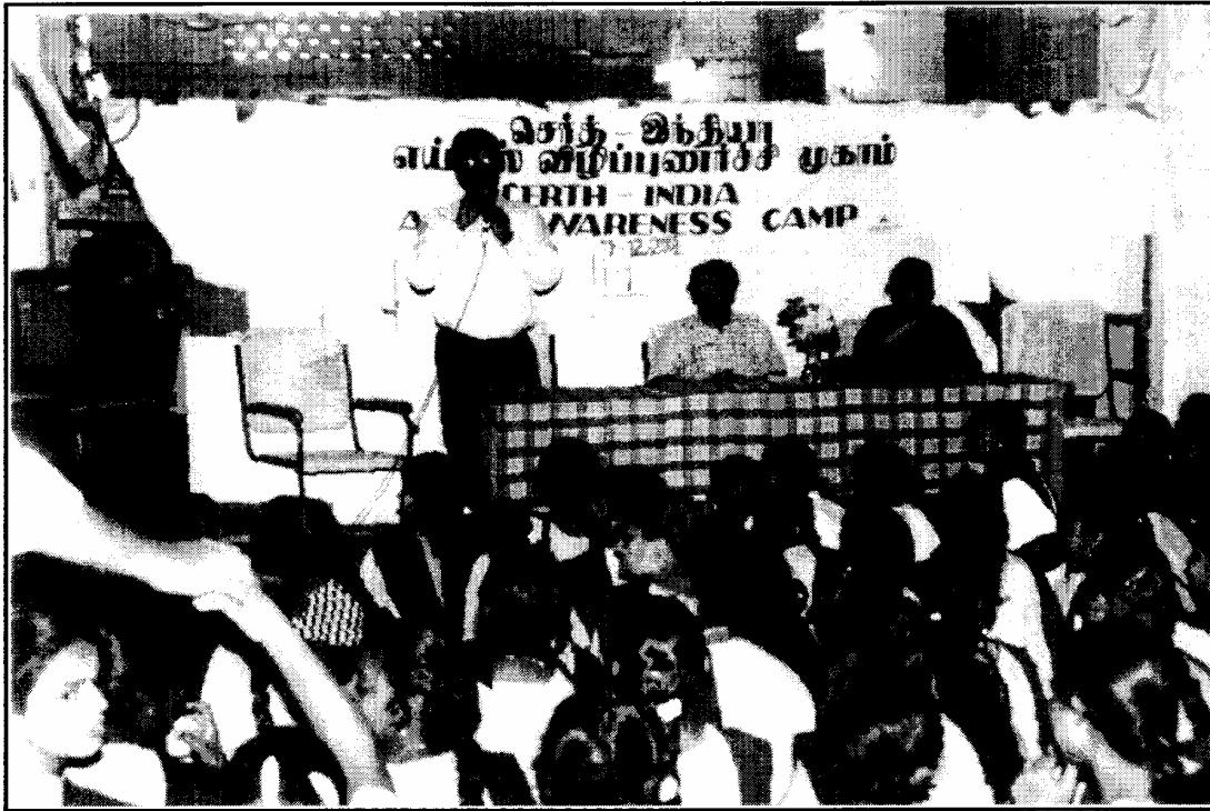
FEW OF THE 200 PARTICIPANTS