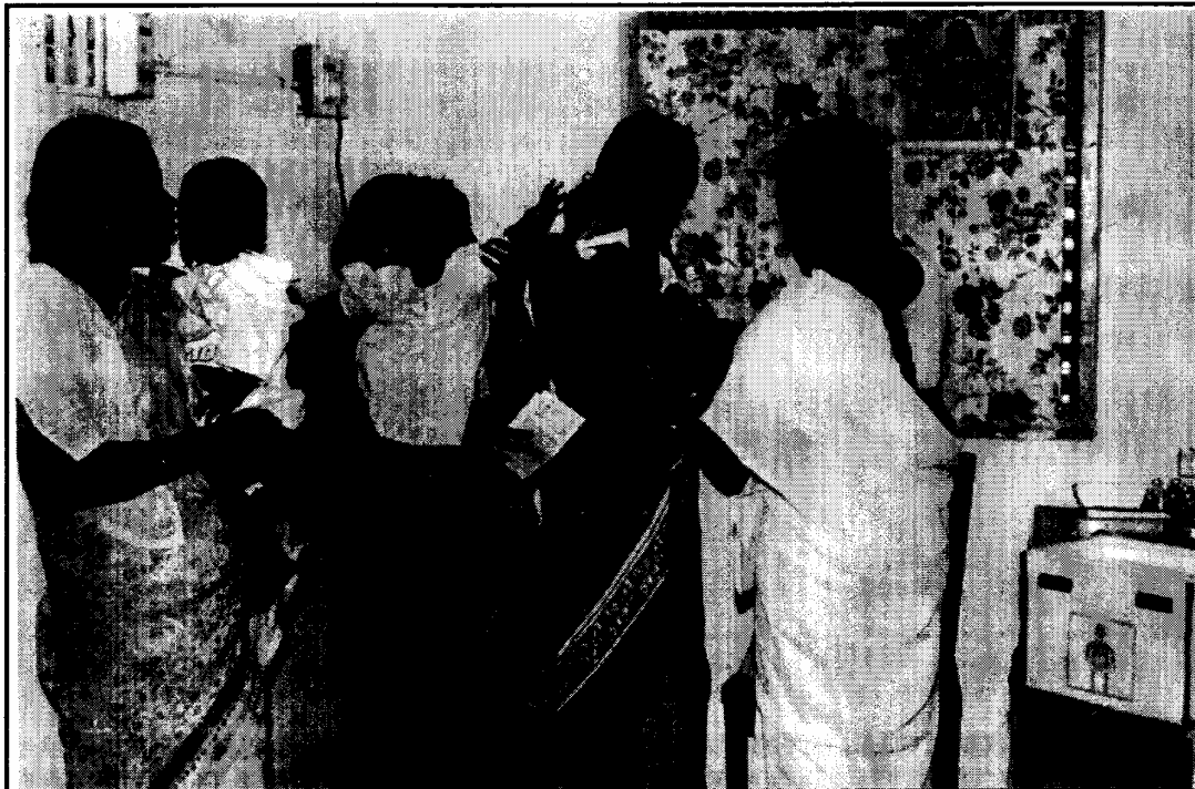
IMMUNISATION IN PROGRESS