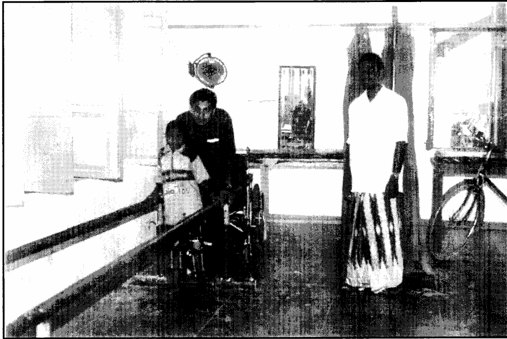
GAIT TRAINING - A ROUTINE IN ORTHO WORKSHOP